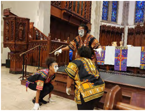
"Angels of Praise" from Woodland PC