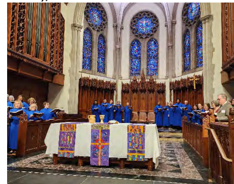
Covenant Church Choir