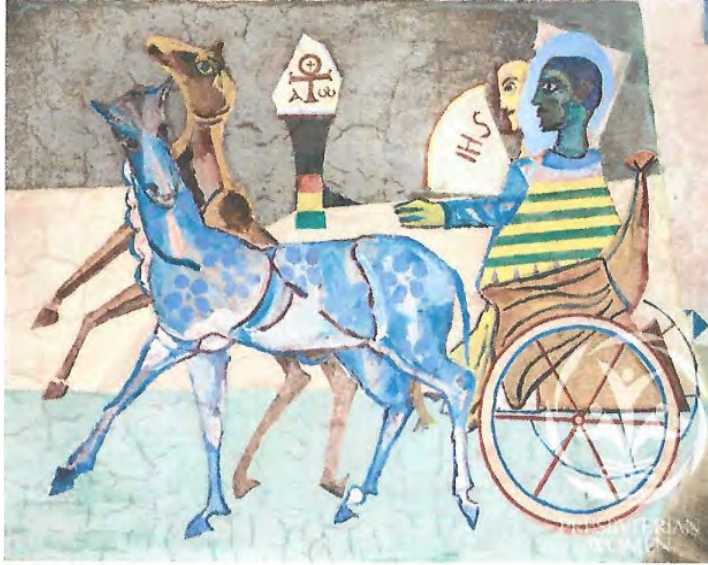
Philip and the Ethiopian Eunuch, Herbert Boeckl